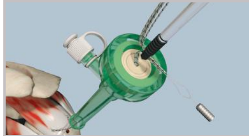
step 2 Load all sutures through the Knotless Anchor using the supplies suture passer.