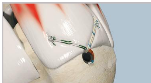
step 8 Completed repair.