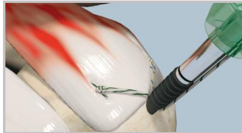
step 4 Remove slack in the sutures.