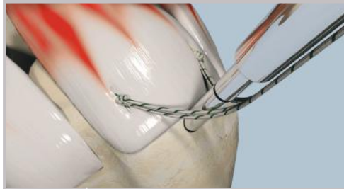
step 1 AWL to first line.