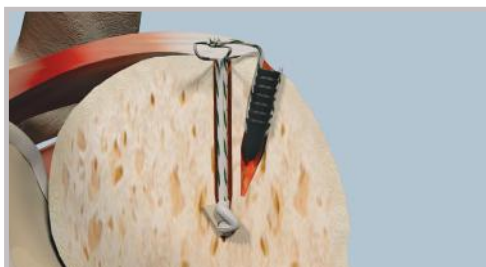
step 7 Shown with Draw Tight 3.2mm suture anchor placed medially.