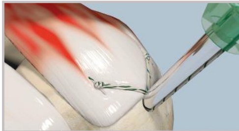
step 5 Tap Knotless Anchor - final tension achieved on insertion.