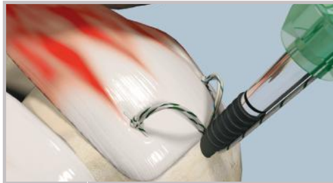
step 3 Firmly place tip of Knotless in pilot hole.