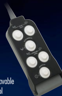
C7115 Autoclavable Remote Control