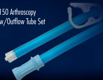
10k150 Arthroscopy Inflow/Outflow Tube Set