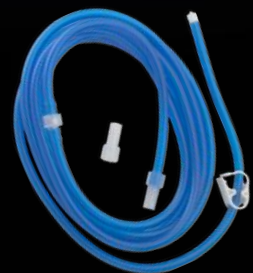
10K605 Eco-Flow™ Single-use Patient Tubing