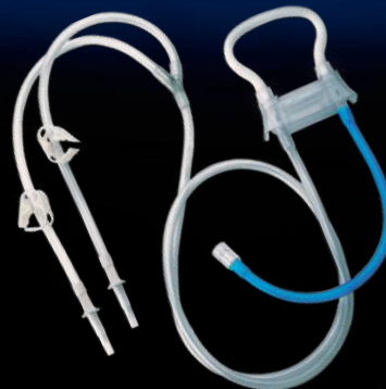
10K600 Eco-Flow™ Day-use Tubing Set